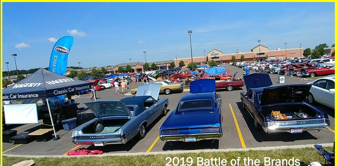
2019 Battle of the Brands