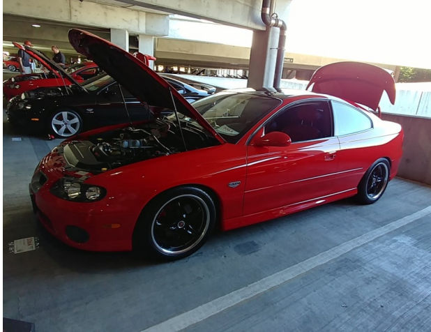
Lance Hudnell 3rd Place 06 Modified