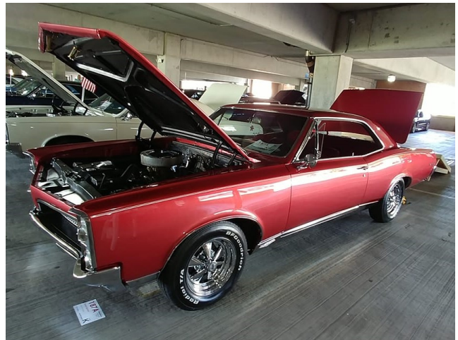
Brent Barham 3rd Place 67 Modified