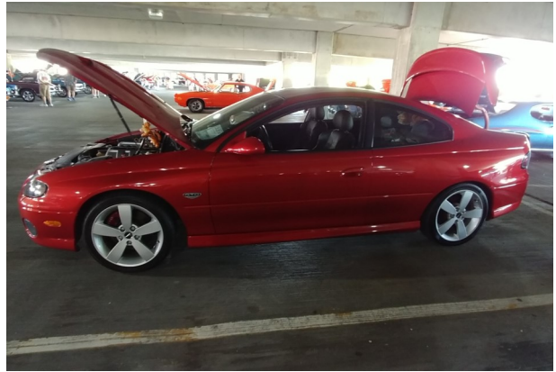
Calvin Furgeson 2nd Place 04-06 Stock