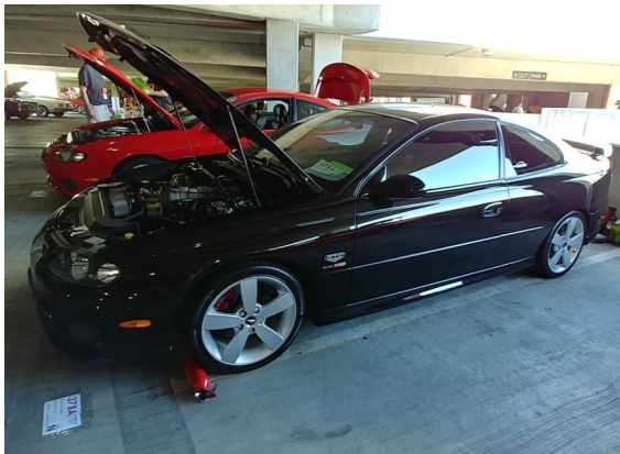
Brian D'Amico 2nd Place 06 Modified