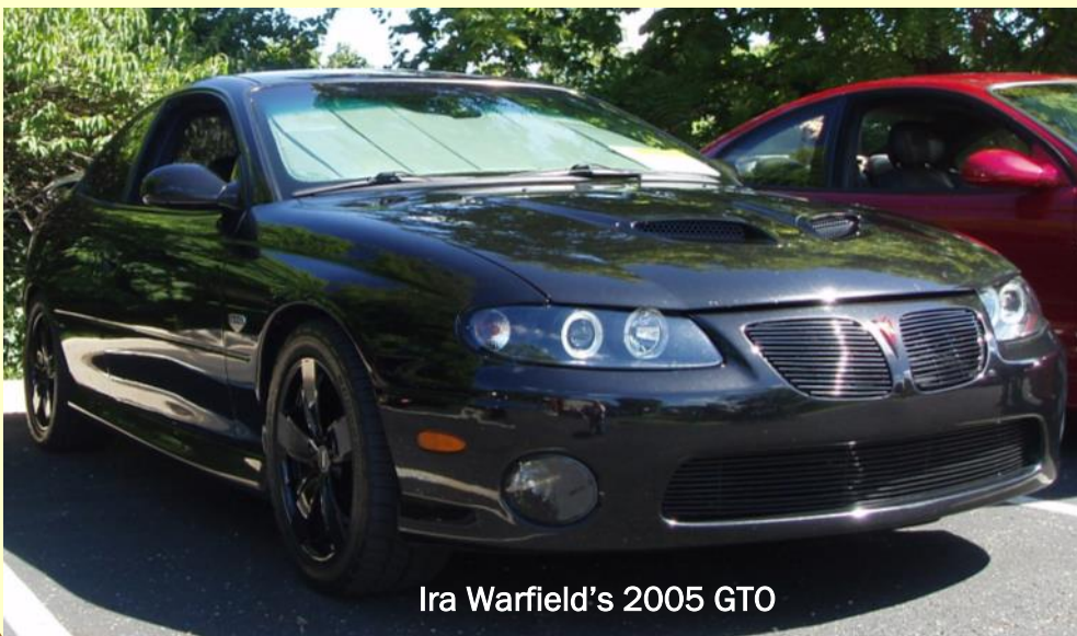
Ira Warfield's 2005 GTO