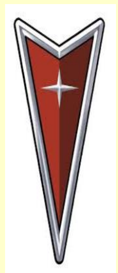
By Art Fitzpatrick