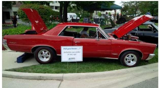
Joe Prince Award of Excellence