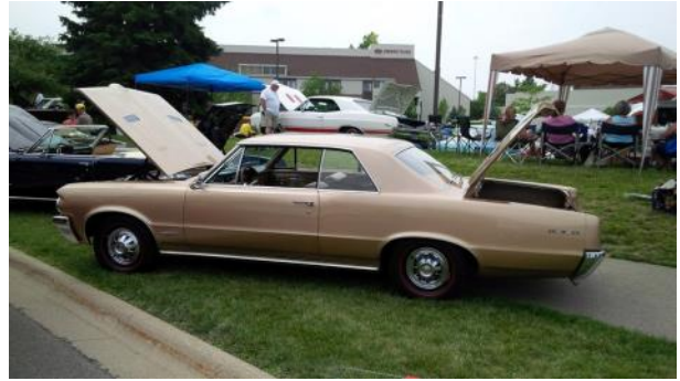
Tom Frazier Award of Excellence