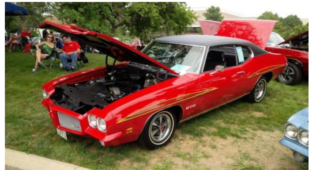
Robert Rutkowski Award of Excellence