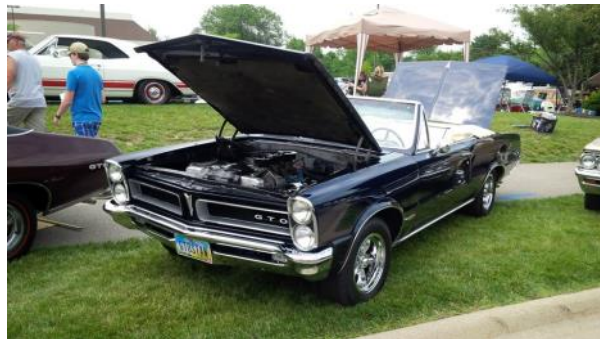
Stan Farlow 1st Place 64-67 GTO Mod.