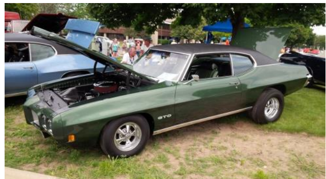
Keith Stevens Award of Excellence