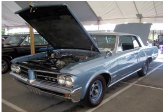
Ron Cozzo: Gold GTOAA Concourse and POCl Points 64 Modified