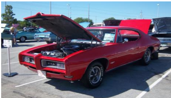
Kevin Russo: 2nd Place Popular Vote 68 Stock