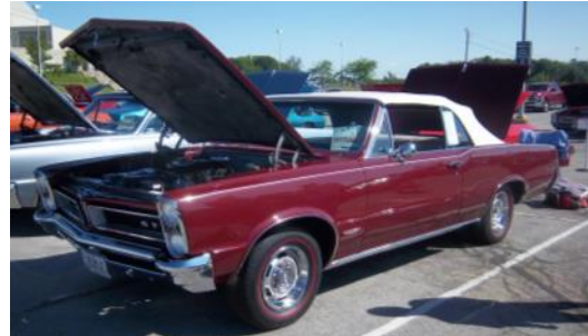
Jim Evans: 2nd Place Popular Vote 65 Conv. Modified