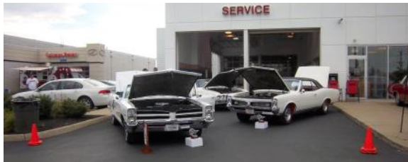
Last Year's Winner's Circle