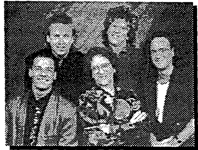
Gary Lewis and the Playboys

12 Noon - 5:30 pm Cruisin' Around Downtown 4:00 pm - 11:30 pm Open Cruise In $5.00 Entry fee to benefit P.L.A.Y. (Private Leisure Assistance for Youth).